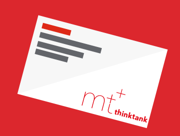
Business cards 250-300