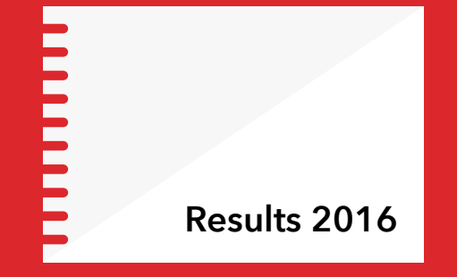
Your presentation also in hard copy